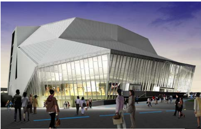
Illustration of Theatre Exterior